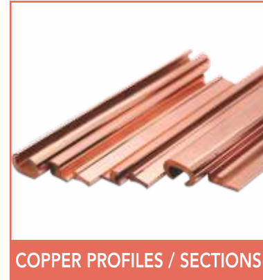
COPPER PROFILES / SECTIONS

Besides our wide range of products and years of experience gained in tooling & product development, we also develop various type of profiles or sections as per our customer requirements.