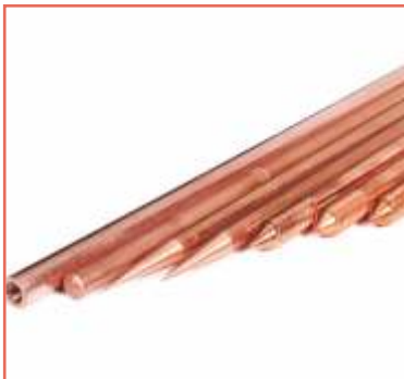
SOLID COPPER EARTH RODS

Size: Width 10mm to 50mm | Thickness 2.5mm & above