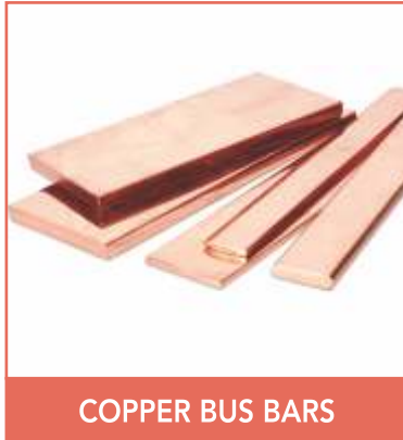
COPPER BUS BARS

CML is a leading manufacturer of Copper Bus Bars. Our production range encompasses a wide spectrum of sizes. We offer flat bars with sharp & round edges as well as full radius. As an experience and reliable with fully integrated production, CML has long been keeping pace with changes in the market. The latest trends involve additional alloying as well as Oxygen Free Copper - and we're involved in those thing too.