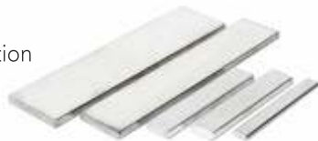
TIN PLATED COPPER BUS BAR