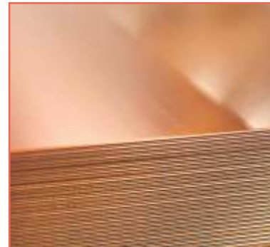
COPPER EARTH PLATES

Pure copper plates provides a long lasting earthing solution in places where driving earth rods might be impractical. They are often installed in conjunction with low resistance earthing compound.