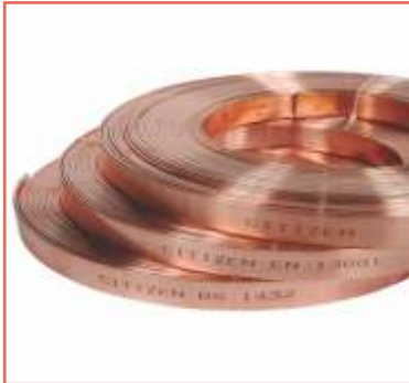
BARE COPPER TAPE

High conductivity electrolytic bare copper tape are widely applicable for Earthing Switch, Terminals, Electrical Conductors etc.