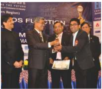
STAR PERFORMER FOR HIGHEST EXPORT 2011-2012 EEPIC INDIA